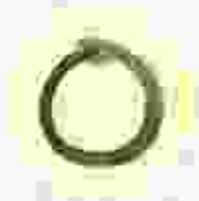
Circle of Life