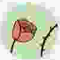
Good and Evil