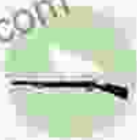
Peace and War