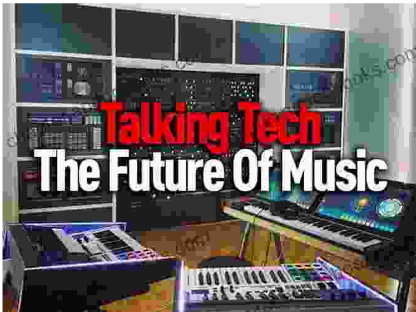
Music and Technology

Music Around the World: Global Encyclopedia Volumes not only documents the past and present of music but also looks ahead to its future. In this final section, visionary musicians, industry experts, and cultural commentators share their perspectives on the evolving nature of music in a globalized world.