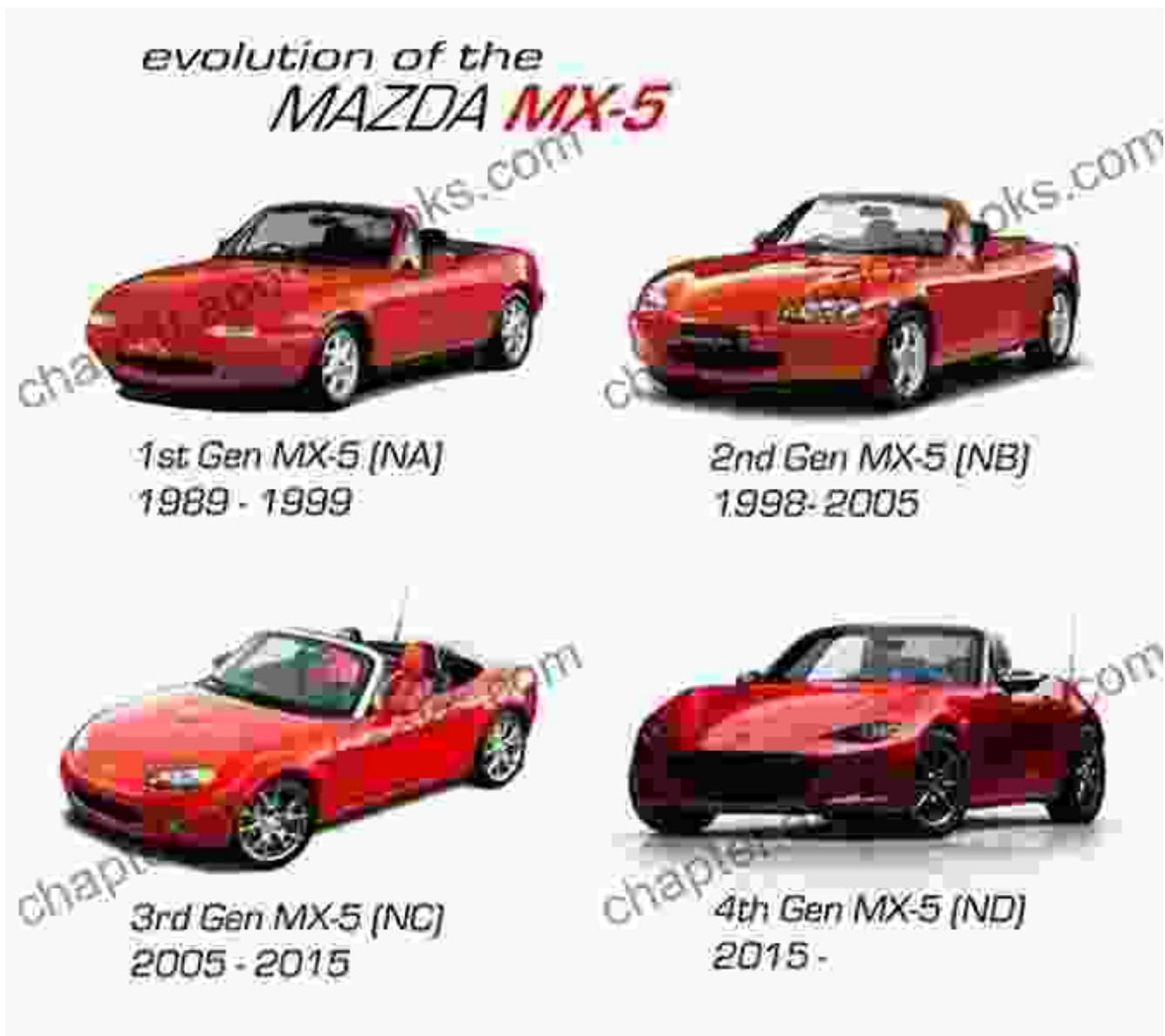
1st Gen MX-5 (NA) 1989 - 1999

for over 30 years. The Miata's enduring appeal lies in its timeless design, its exceptional driving dynamics, and its affordability.