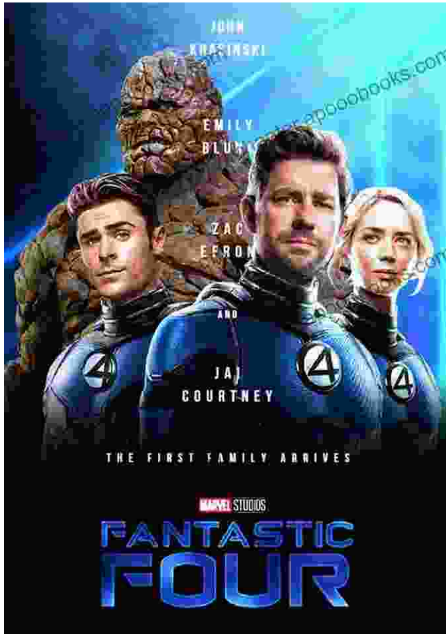
The Fantastic Four in the Marvel Cinematic Universe, as depicted in the 2015 film "Fantastic Four".

Nearly six decades after their debut, the Fantastic Four continue to be one of the most popular and influential comic book series of all time. The characters have been adapted into numerous films, television shows, and video games, and they have become icons of American pop culture.