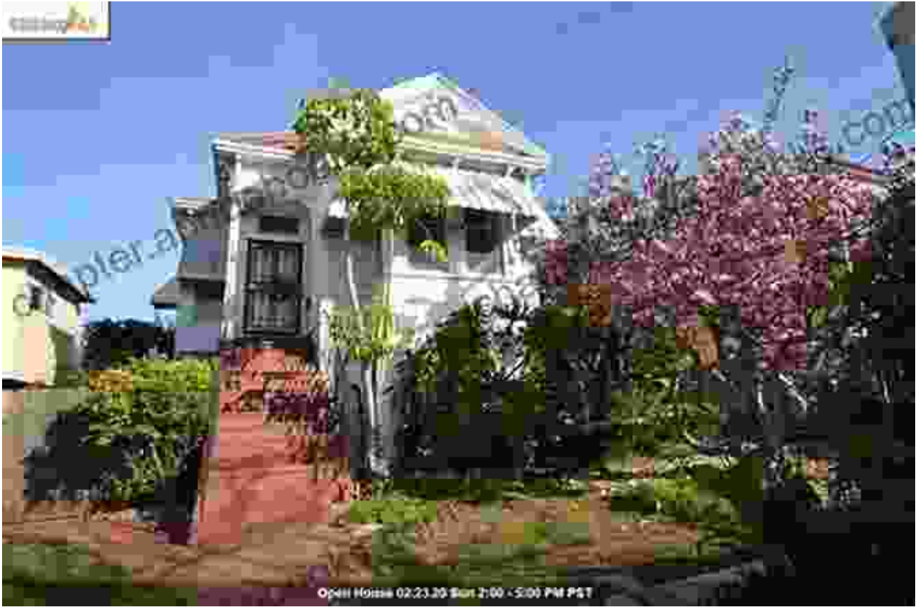
The Lorin District is home to a number of historic homes.