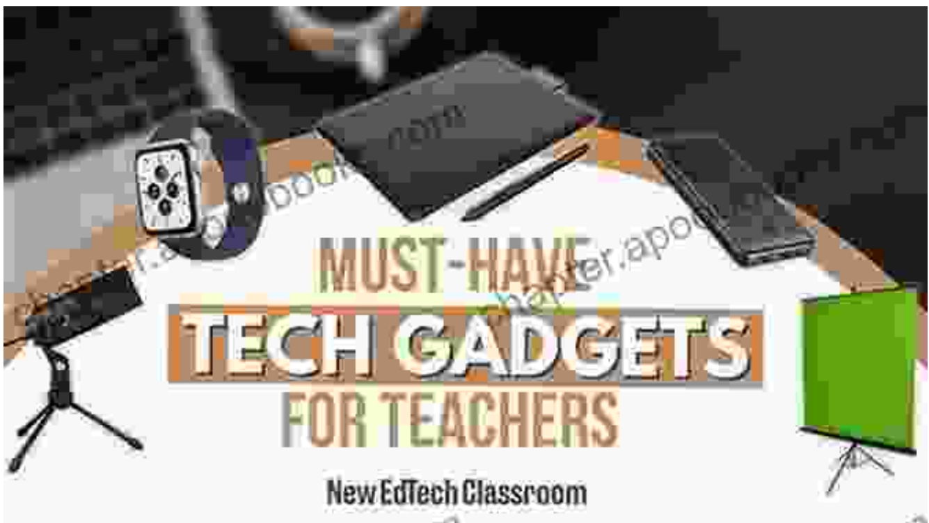
Educational Tech Gadgets For Students And Teachers book cover

Free Download your copy today and unlock a world of educational possibilities!