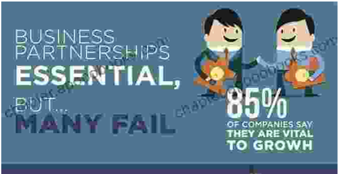
Figure 2: Strategic Partnerships in Wholesaling

Unleash the transformative power of strategic partnerships and learn how to forge mutually beneficial alliances that drive growth. 'Chronicles of Wholesaler' reveals the secrets to identifying potential partners, negotiating win-win agreements, and leveraging synergies to maximize value.