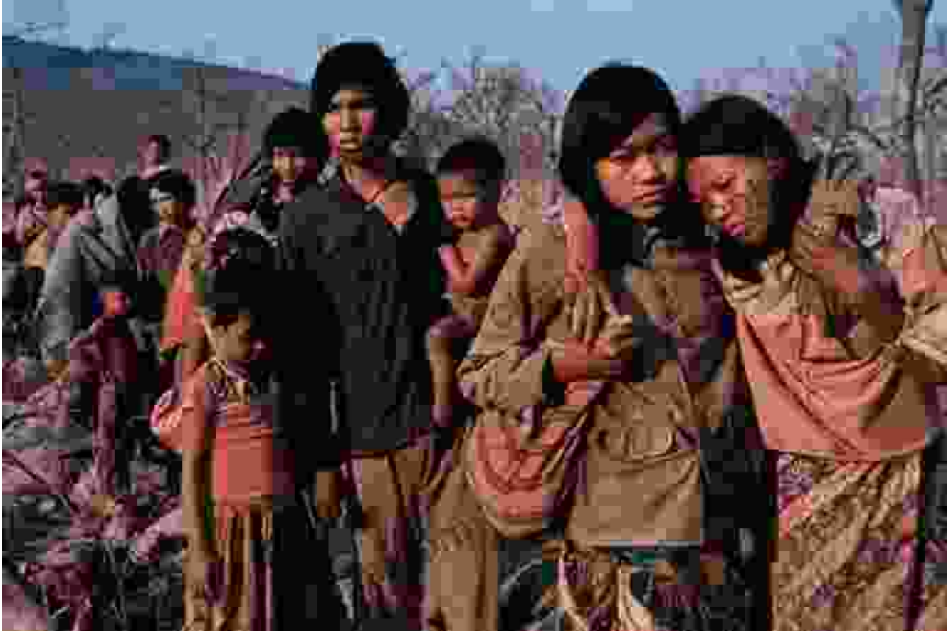
Cambodian refugees arriving in the United States

The second chapter examines the arrival of Cambodian refugees in the United States. Readers will discover the challenges they faced as they adjusted to a new culture, language, and way of life.